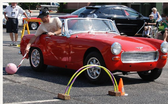
Top Down Fun at Conclave Funkhana