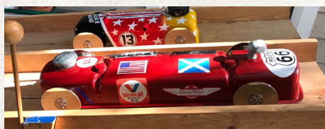
Rocker Cover Racers at the Ready

Check-in , time for a Car Wash (on site) or to relax in the Social Center. No host evening Cocktail Party with appetizers and a special Guest Speaker . Silent Auction, Arts and Crafts