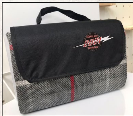
Folding picnic blanket doubles as a knee warmer in your car