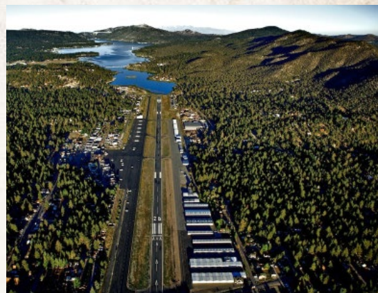
Beautiful Big Bear Airport

The Gymkhana requires advance reservation (but no charge), while the Funkhana is strictly "drop in and enjoy". Spectators are welcome at both events and there is an excellent restaurant at the airport.