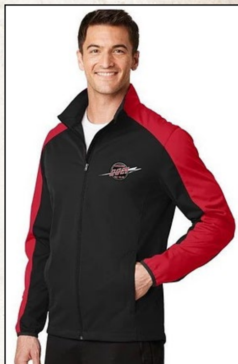
Two different men's jackets are offered

In addition to clothing, other Conclave themed items are on sale, including grille badges, adhesive backed commemorative tokens, event pins, picnic blankets and even extra copies of the cute Conclave mascot teddy bear (one will be provided free to each registered party).