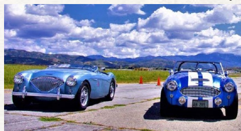
Don't Be Blue, Come to Conclave

to your parking spot on Pine Knot Avenue, the main drag in Big Bear where we will wow the tourists with our dazzling cars. Late afternoon will see the