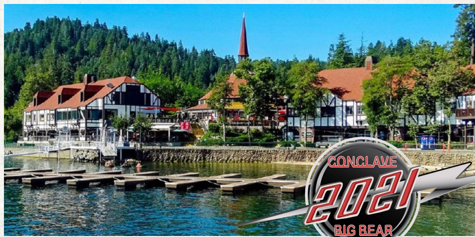
Lake Arrowhead Village