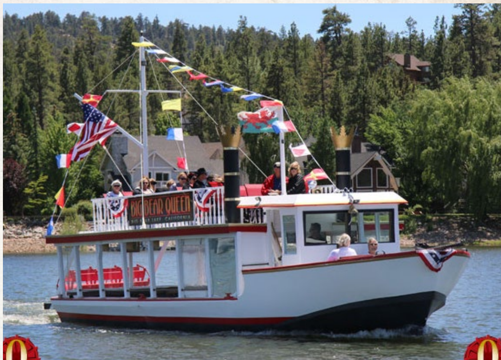
The Big Bear Queen, a paddlewheel boat, giving tours of Big Bear Lake on Tuesday and Wednesday evening.

On Monday evening, following a no host cocktail party, guests are invited to experience an authentic Santa Maria BBQ Dinner, the original California BBQ. Santa Maria-style ® barbecue is a regional