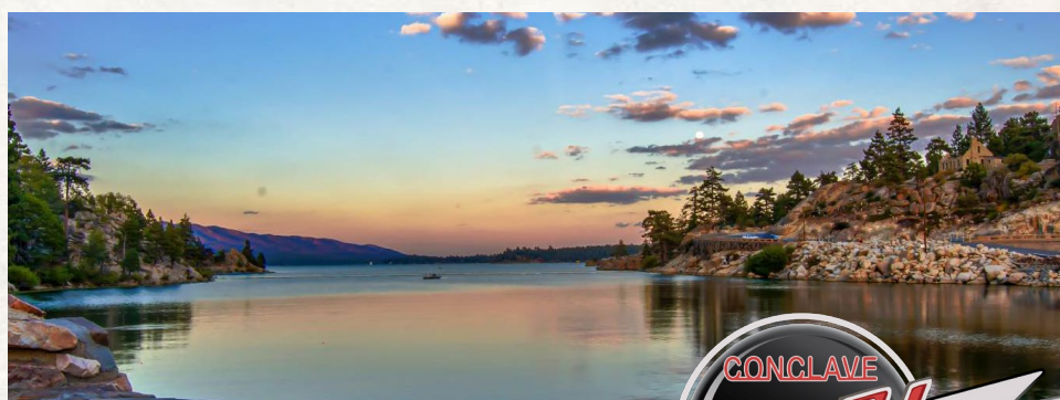
Join the fun May 16-21, 2021 at Big Bear Lake, CA!