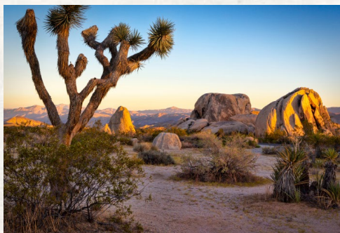
Joshua Tree National Park, Cali.

On Tuesday, May 18th Conclave guests will have a choice of a dramatic Scenic Drive at their own pace, or participation in the Time/Speed/Distance (TSD) Rally. Both events will cover the same route with Joshua Tree National Park being the destination.