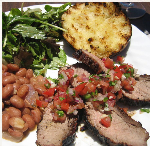
An authentic Santa Maria BBQ Dinner will be offered on Monday evening.

Don't miss out on this unique culinary experience!